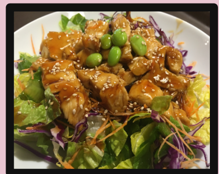
Teriyaki Chicken Salad

PLEASE TELL YOUR SERVER ABOUT ANY ALLERGIES AND OTHER DIETARY RESTRICTIONS.