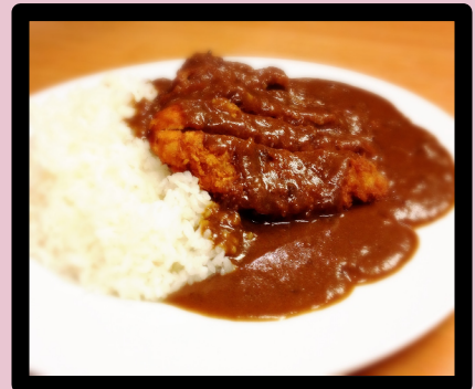
Chicken Cutlet Curry