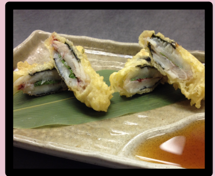
White Fish Tempura