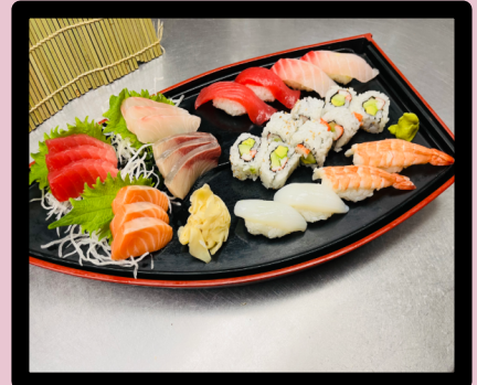
Sushi & Sashimi Boat