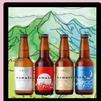
Kawaba Craft Beers