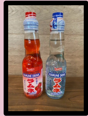
Strawberry & Original Ramune