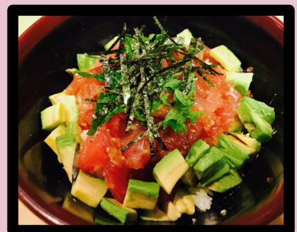
Tuna Yukke Don

PLEASE TELL YOUR SERVER ABOUT ANY ALLERGIES AND OTHER DIETARY RESTRICTIONS.