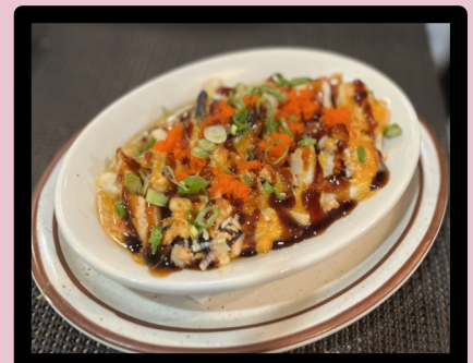
Baked Spicy Seafood

PLEASE TELL YOUR SERVER ABOUT ANY ALLERGIES AND OTHER DIETARY RESTRICTIONS.